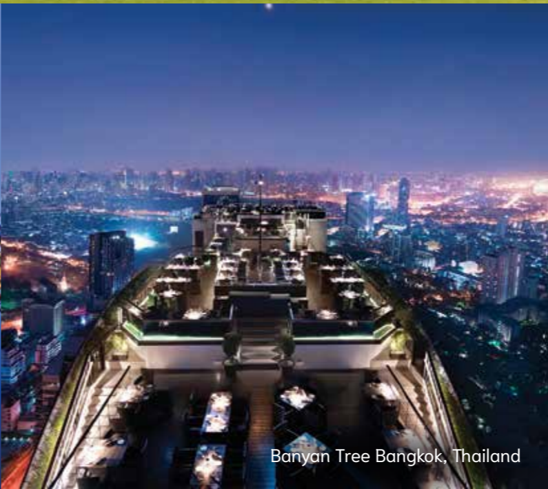
Banyan Tree Bangkok, Thailand