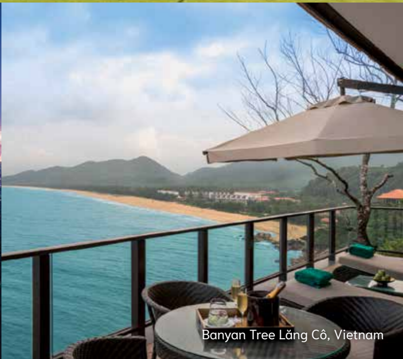
Banyan Tree Lăng Cô, Vietnam