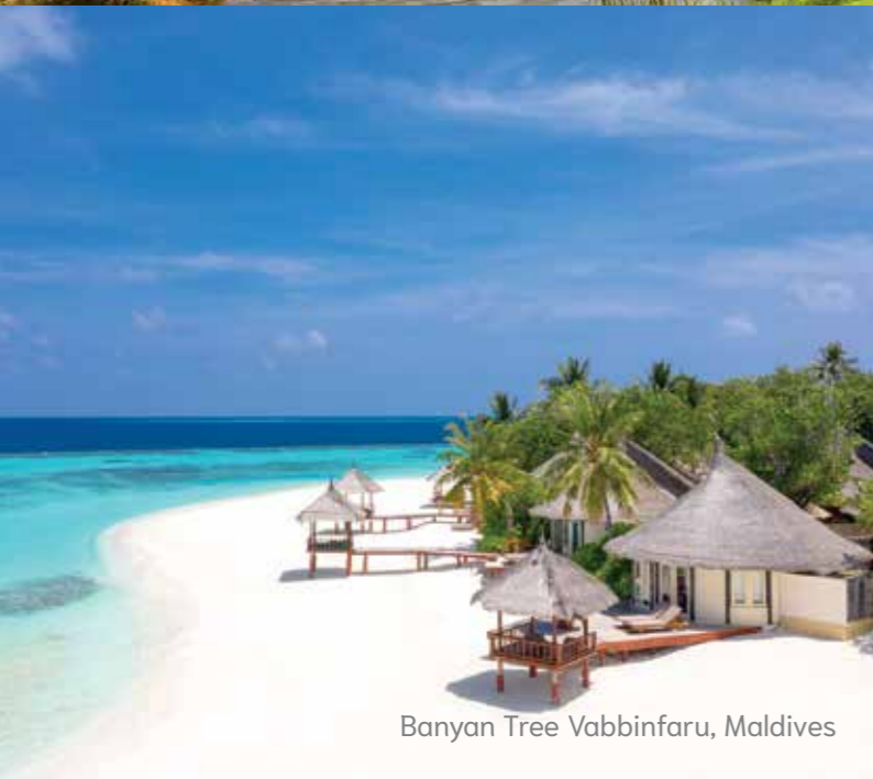
Banyan Tree Vabbinfaru, Maldives