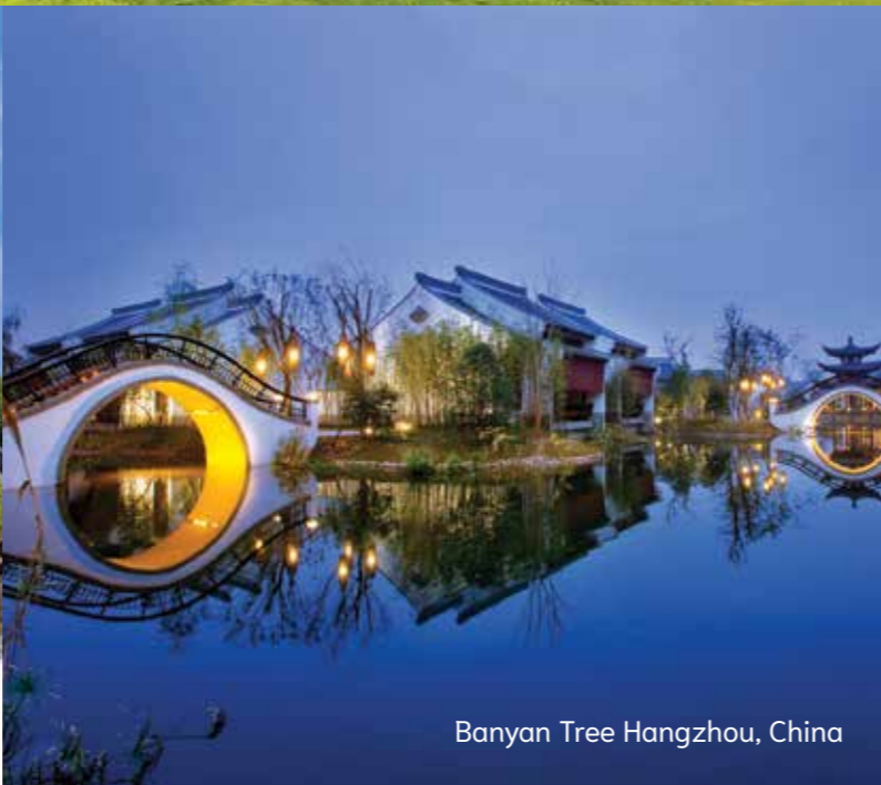
Banyan Tree Hangzhou, China